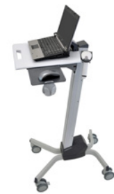
Neo-Flex Laptop Cart 24-205-214 two-tone grey