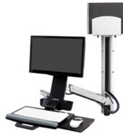
StyleView Sit-Stand Combo System Combo System with worksurface: 45-270-026 Combo Arm, medium CPU holder and wall track, polished aluminum 45-272-026 Combo Arm, small CPU holder and wall track, polished aluminum Combo System: 45-271-026 Combo Arm, medium CPU holder and wall track, polished aluminum 45-273-026 Combo Arm, small CPU holder and wall track, polished aluminum