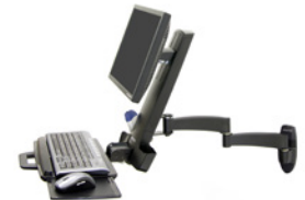
200 Series Combo Arm 45-230-216 white 45-230-200 black