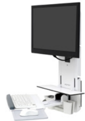
StyleView Sit-Stand Vertical Lift Patient Room 61-080-062 white Patient Room 61-080-085 black High Traffic Area 61-081-062 white High Traffic Area 61-081-085 black