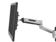
LX Sit-Stand Wall Arm 45-353-026 polished aluminum HD 45-383-026 polished aluminum