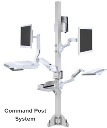
Command Post System