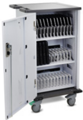
YES Basic Charging Cart YESBASGMPW4 white