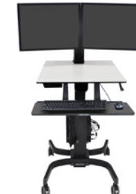
WorkFit™-C LCD LD (Light Duty) 24-215-085 black LCD HD (Heavy Duty) 24-216-085 black Dual 24-214-085 black