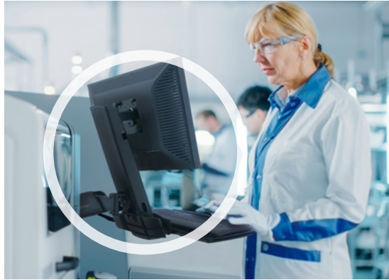
200 Series Combo Arm

With features designed to save time and maximize floor space, Ergotron's professional-grade solutions create flexible workspaces for warehouses, back office environments that support efficiency, employee well-being and overall productivity.