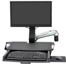
StyleView Sit-Stand Combo Arm Combo Arm with worksurface: 45-260-026 polished aluminum Combo Arm: 45-266-026 black head-assembly only, polished aluminum Extender Arm: 45-261-026 polished aluminum