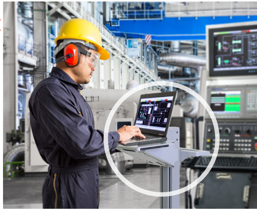
Neo-Flex Laptop Cart