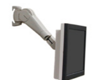
400 Series Wall Mount LCD Arm 45-007-099 grey 45-007-085 black