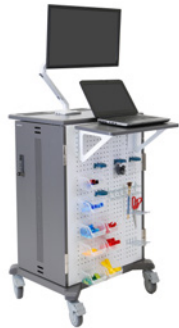
YES24 Adjusta™ Charging Cart YES24-CHR-1 white