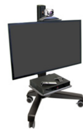
Neo-Flex™ Mobile MediaCenter LD (Light Duty) 24-190-085 black VHD (Very Heavy Duty) 24-191-085 black UHD (Ultra Heavy Duty) 24-192-085 black Camera Shelf Kit 97-491-085