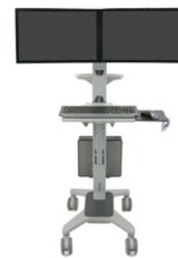
Neo-Flex WideView WorkSpace Dual LCD 24-194-055 two-tone grey