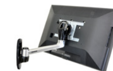
LX HD Wall Mount Swing Arm 45-268-026 polished aluminum Pivot 45-269-009 black