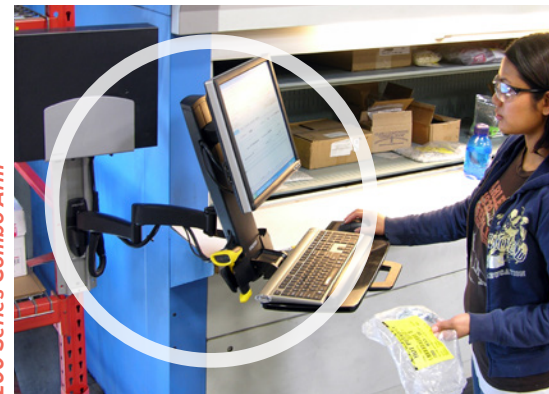
200 Series Combo Arm