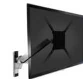
Interactive Arm HD 45-296-026 polished aluminum VHD 45-304-026 polished aluminum