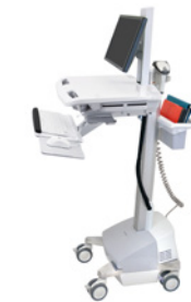
StyleView™ 42 Series LCD pivot version shown Powered with SLA or LiFe battery