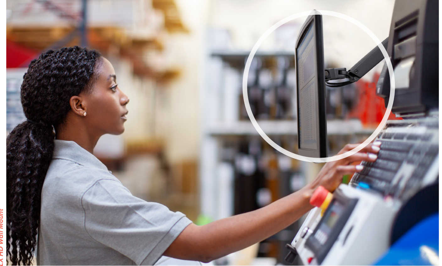
LX HD Wall Mount