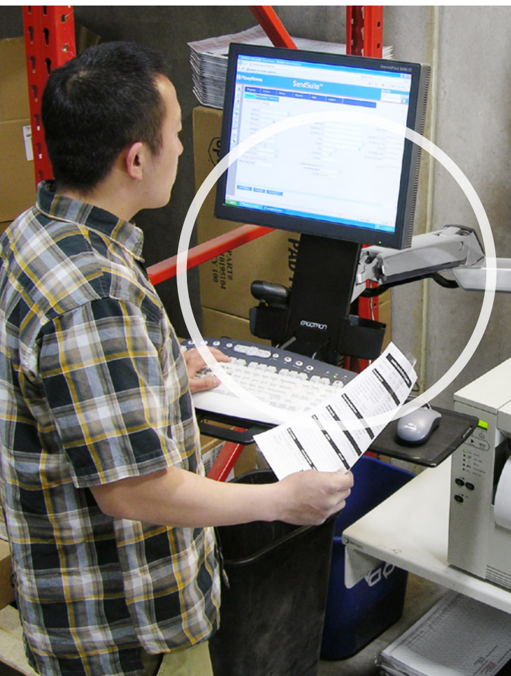
StyleView™ Sit-Stand Combo System